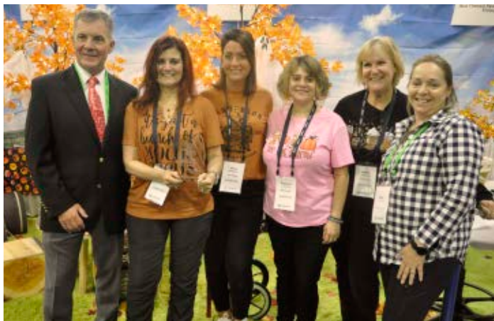
First place: Red Thread

At our annual Expo, MHEC selects three booths that we feel best reflects the event's theme. This year, the theme was "Autumn in New England," and winners of the booths, the exhibitors, and MHEC staff are below.