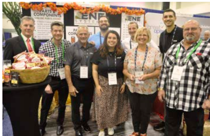
Second place: ENE Systems