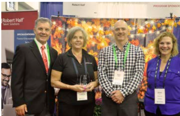
Third place: Robert Half